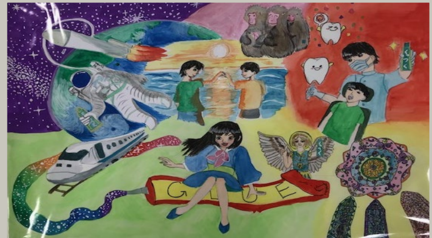
Higher grade Special