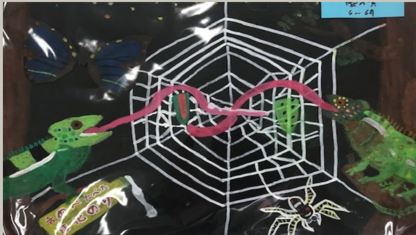
Higher grade Excellence