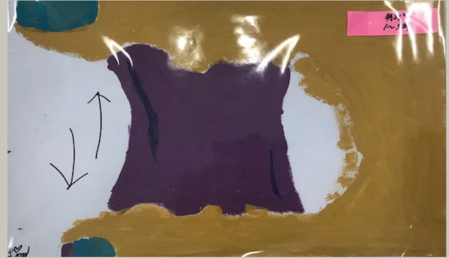
Lower grade Special