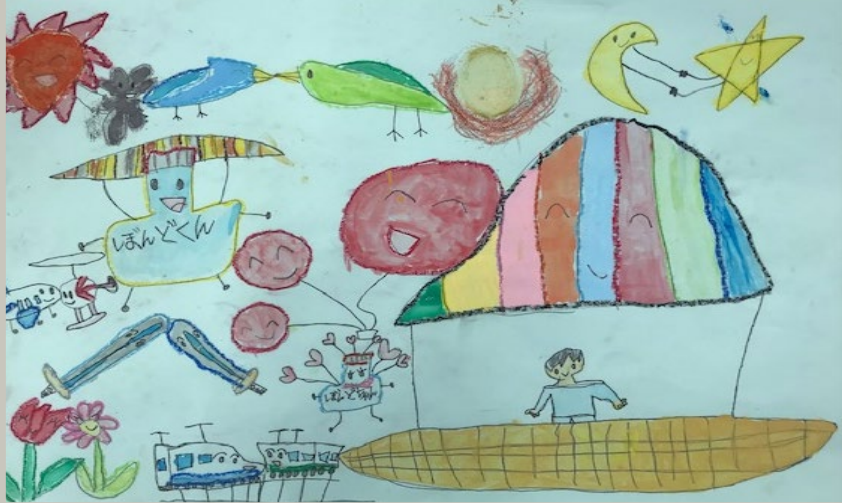
Lower grade Excellence