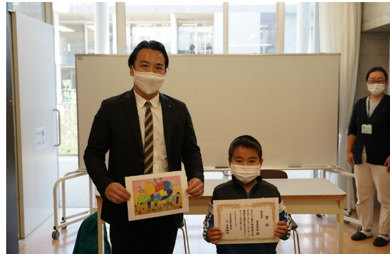
Award Ceremony of Poster Competition